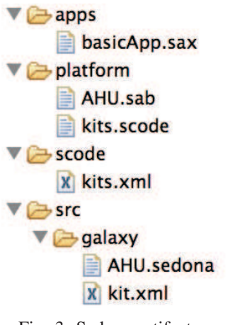
Fig. 3: Sedona artifacts

".sedona" extension and compiled by the sedonac tool.